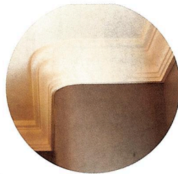
CROWN DETAILING REPLICATES THE OLD STYLE