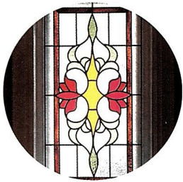
ORIGINAL STAINED GLASS WINDOWS

vecchiola@mondeau.ca 613-831-8963 ext 1520