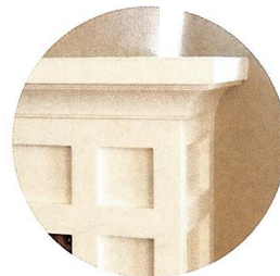
THE ORIGINAL FIREPLACE MANTEL